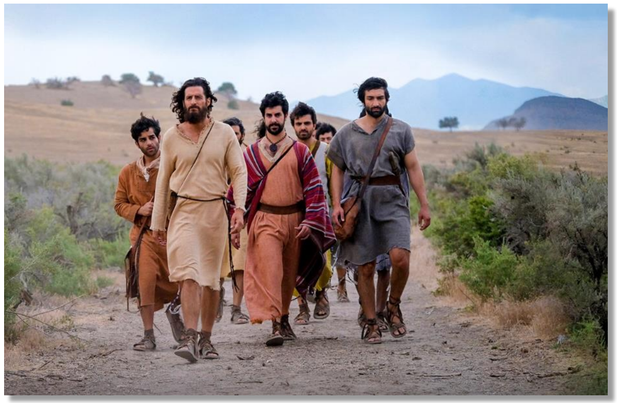
You can watch this episode via The Chosen app on your smartphone or tablet, or via your web browser on thechosen.tv <u>here</u>.